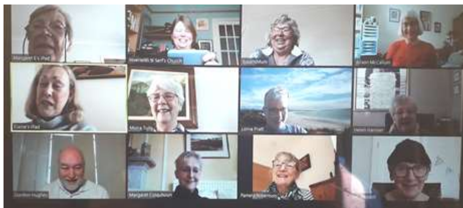
The Sunday zoom coffee community on April 11

If you have access to ZOOM, you will be most welcome to join the Sunday coffee chat at 11.15.