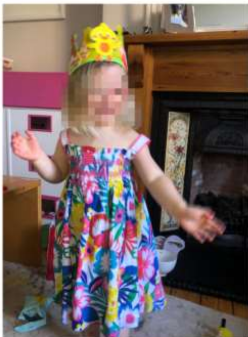
Sophie dancing with her Easter crown