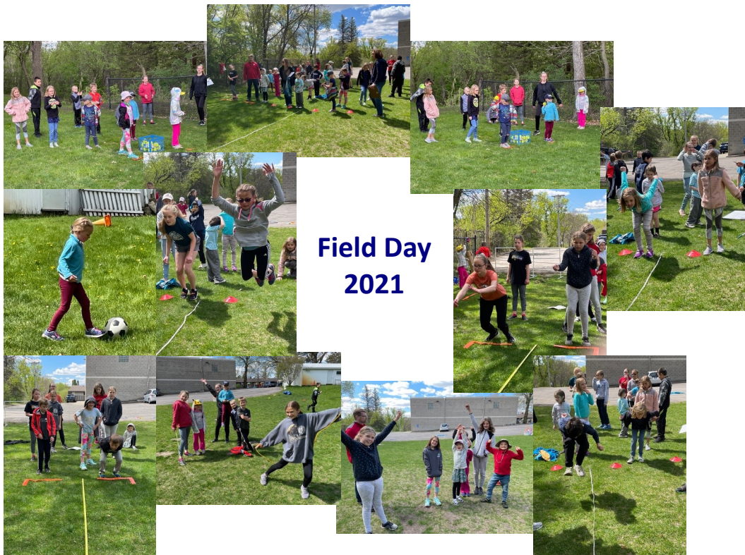
Field Day 2021

Berea Lutheran School 9308 Rich Valley Blvd. Inver Grove Heights, MN 55077 651-994-1074 www.BereaCLC.org