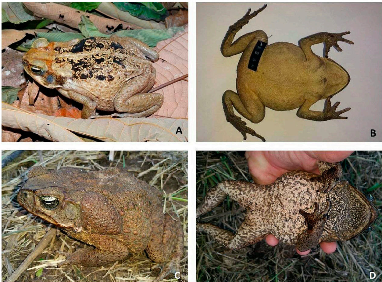
Figure 1. Rhinella poeppigii and R. marina , municipality of Assis Brasil, Acre, Brazil. A, B. Dorsal and ventral views of R. poeppigii (male). C, D. Dorsal and ventral views of R. marina (male).