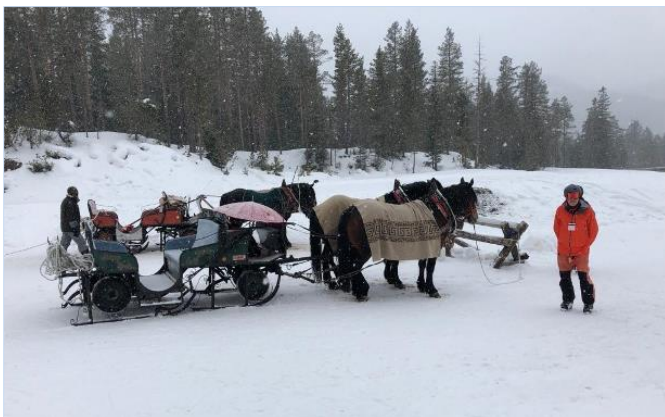
The horse lift

It was about 1 km further in traversing, but we came upon some horses, attached to carriages, with long ropes trailing behind. The skiers (us) would hold onto the ropes and the horses would pull us along, about 2km, mostly flat, but slightly uphill.