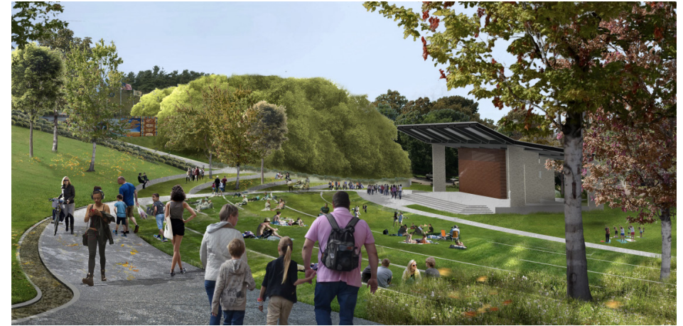
ABOVE: Rendering of Memorial Park

Siloam Springs is a quaint and friendly town full of history in Northwest Arkansas with a growing appreciation and desire for public art. The heart of the town is its award-winning downtown, which exemplifies what makes Siloam Springs unique: a vibrant and diverse business community in a cherished natural and historic setting. Downtown Siloam Springs is adjacent to the much-anticipated Memorial Park (opening Spring 2019) which will promote wellness and the arts, with plenty of open green space, a splash pad, Farmers Market and demonstration kitchen, a new amphitheater, and several sites for future public artworks. Siloam Springs has a population of approximately 16,500, but it is home to the third busiest entryways into Arkansas and has a trade area population of over 62,000. Siloam Springs' acclaimed restaurants and shopping, charming historic district, and natural assets make it a desirable tourist location, and will gain increasing attention as the arts continue to develop and enrich the town.