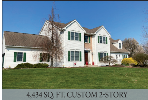
4,434 SQ. FT. CUSTOM 2-STORY