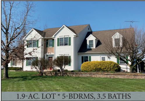
1.9-AC. LOT * 5-BDRMS, 3.5 BATHS