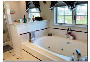
MASTER BATH W/WHIRLPOOL TUB