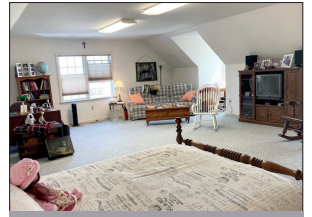
26' X 18' BONUS 5TH BDRM