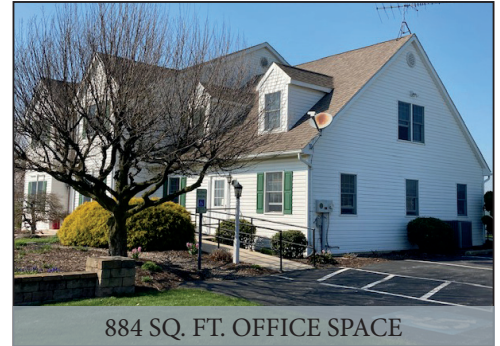
884 SQ. FT. OFFICE SPACE

Located at 100 Springhead Rd. Gap, Pa. Salisbury Twp. Lancaster Co.