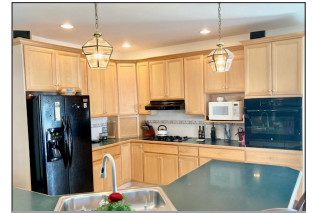
CUSTOM CABINETRY KITCHEN

REAL ESTATE: consists of a 4,434 sq. ft. custom-built 5-bedroom 2-story home w/attached 2-car garage on a rural 1.9-acre lot! Main floor features a soaring open staircase & foyer w/tile flooring; stunning custom cabinetry kitchen w/center island/bar; appliance included, huge walk-in pantry; breakfast nook w/cathedral ceiling, skylights & tile flooring; 17'x19' family room w/LP fireplace, French doors to rear deck w/PVC pergola & private in-ground pool; 14'x14' in-home office area; 12'x13' music room w/closet; full bath; 10'x16' library w/bookshelves, French doors, wainscoting & tile flooring; laundry w/wash tub; attached 24'x26' 2-car garage. Upper level includes 18'x13' primary bedroom w/WIC & bath w/whirlpool tub & shower; 3-bedrooms w/double closets; bonus 26'x18' 5th bedroom w/closet; attic storage room. Basement is partially improved w/24'x30' gym/workout area; 16'x18' workshop; storage area; 2nd exit via garage; gas furnace/central AC; 200-amp svc, separate svc for office space; on-site well & septic system; annual taxes: $7857. OFFICE AREA: features a versatile 884 sq. ft. professional office space w/waiting room, 2-offices, 2-exam rooms ; ½ bath; 8-parking spaces; handicap accessible. Outbuilding: a 12'x18' utility barn & fenced pasture area; large level backyard w/space for garden, animals OK!