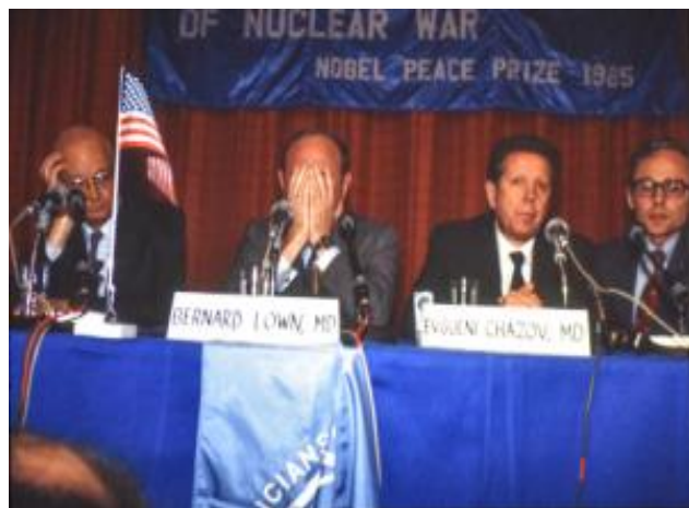
Dr. Eugeni Chazov administers CPR to a Soviet journalist in Oslo as Dr. Bernard Lown looks on at upper left. Drs. Lown and Chazov respond emotionally after the event.