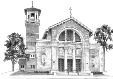
St. Joseph Church 1847