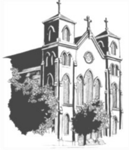
Emmanuel Church 1837