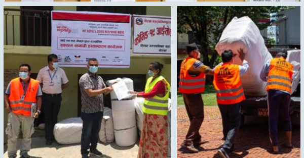
Handing over health items to government institutions in some of our working areas