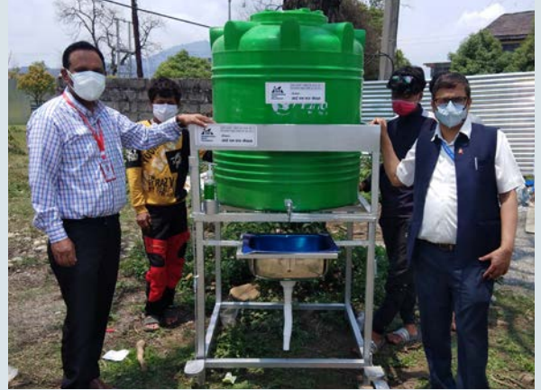
Pokhara - Hand-washing station setup by INF Nepal in Pokhara Academy of Health Sciences

104 Households of people with disabilities and other marginalised families have been provided with immediate food relief packages in Banke, Kapilvastu and Kaski.