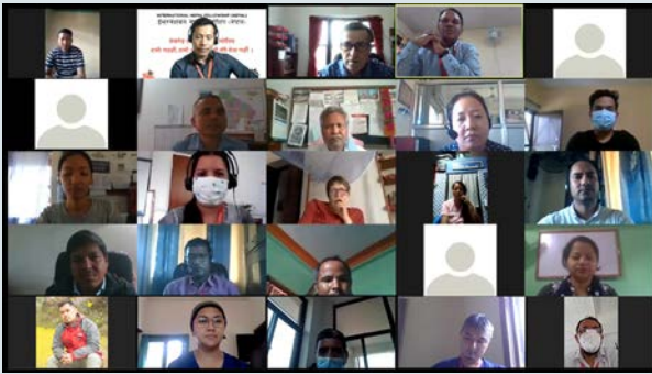
INF Nepal is regularly organising virtual programme as a part of staff care and support