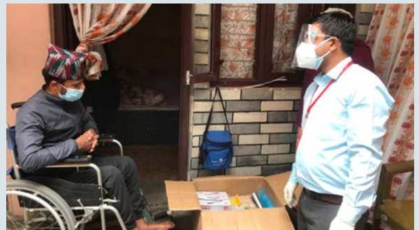
Pokhara - visiting COVID infected staff and handing over GET WELL SOON package