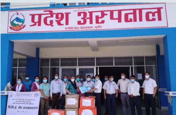
Surkhet - PPE handover to Provincial Hospital