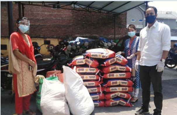
Banke - Preparing food packages to be distributed for 15 needy families