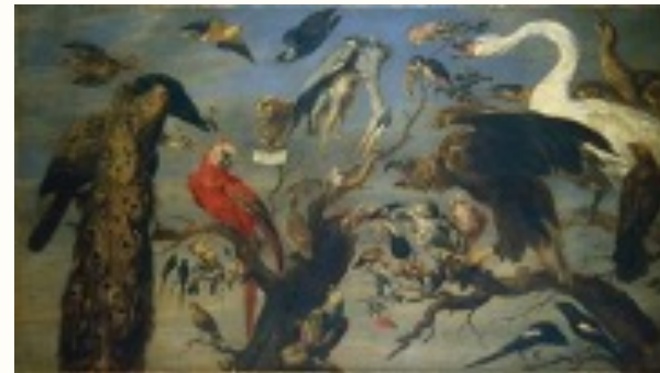
Snyders, Birds Concert , ca. 1630-40 oil on canvas

Cecily Brown's vivid fusions of abstraction and figuration, chaos and stillness, fantasy and reality, nature and flesh are forged from a deep love of painting as a medium and art history as a catalyst for inspiration. Beginning in 2019, she returned to her love of Renaissance masters to execute a series of grand-scale contemporary commentaries on the palettes, genres, and themes explored in seventeenth century works. With its evocative title, The Demon Menagerie takes on a motif known as "concerts of birds," popularized by Flemish painter Frans Snyders (1579-1657), which depict an array of