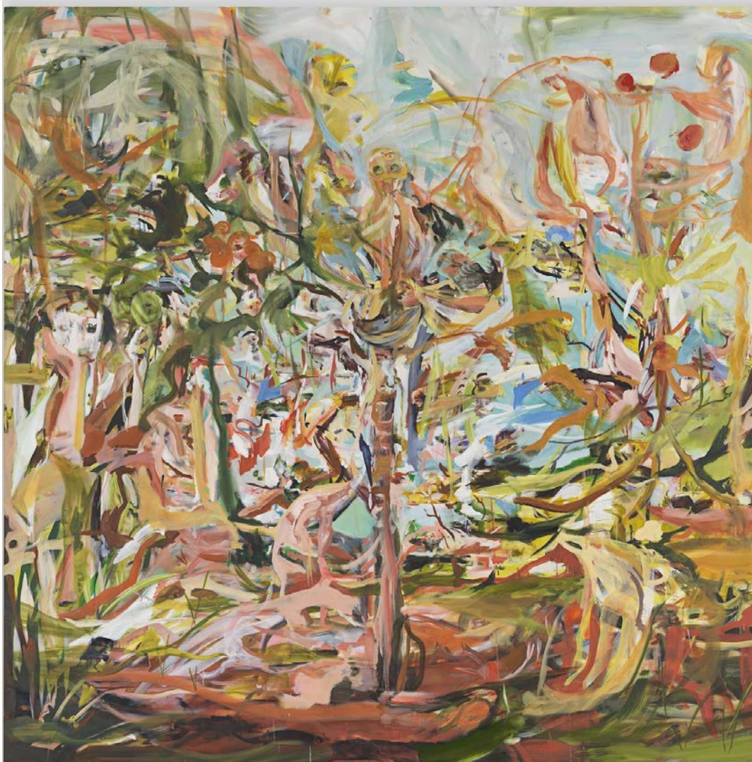
Cecily Brown (British, b. 1969) The Demon Menagerie , 2019-20 Oil on linen