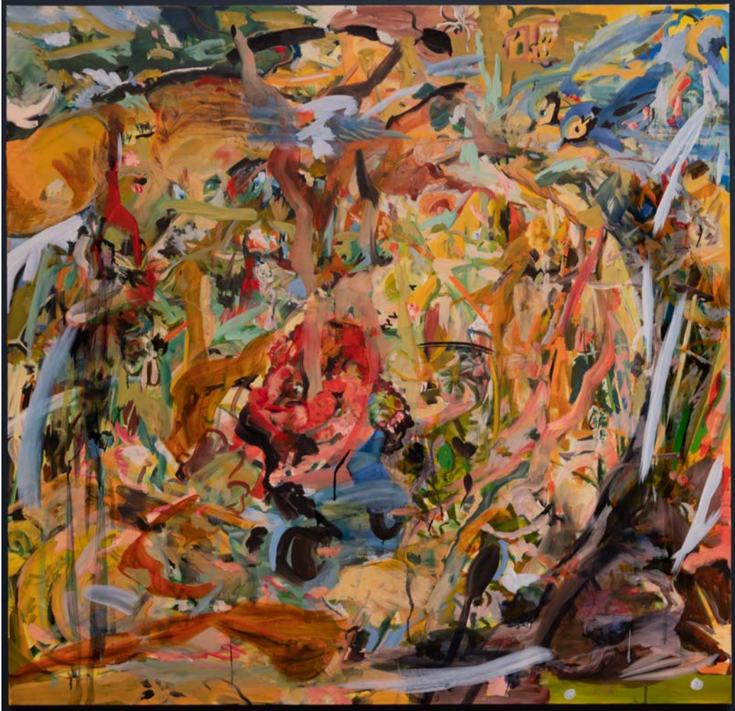
Cecily Brown (British, b.1969) Thrice Happy Green , 2019-20 Oil on linen