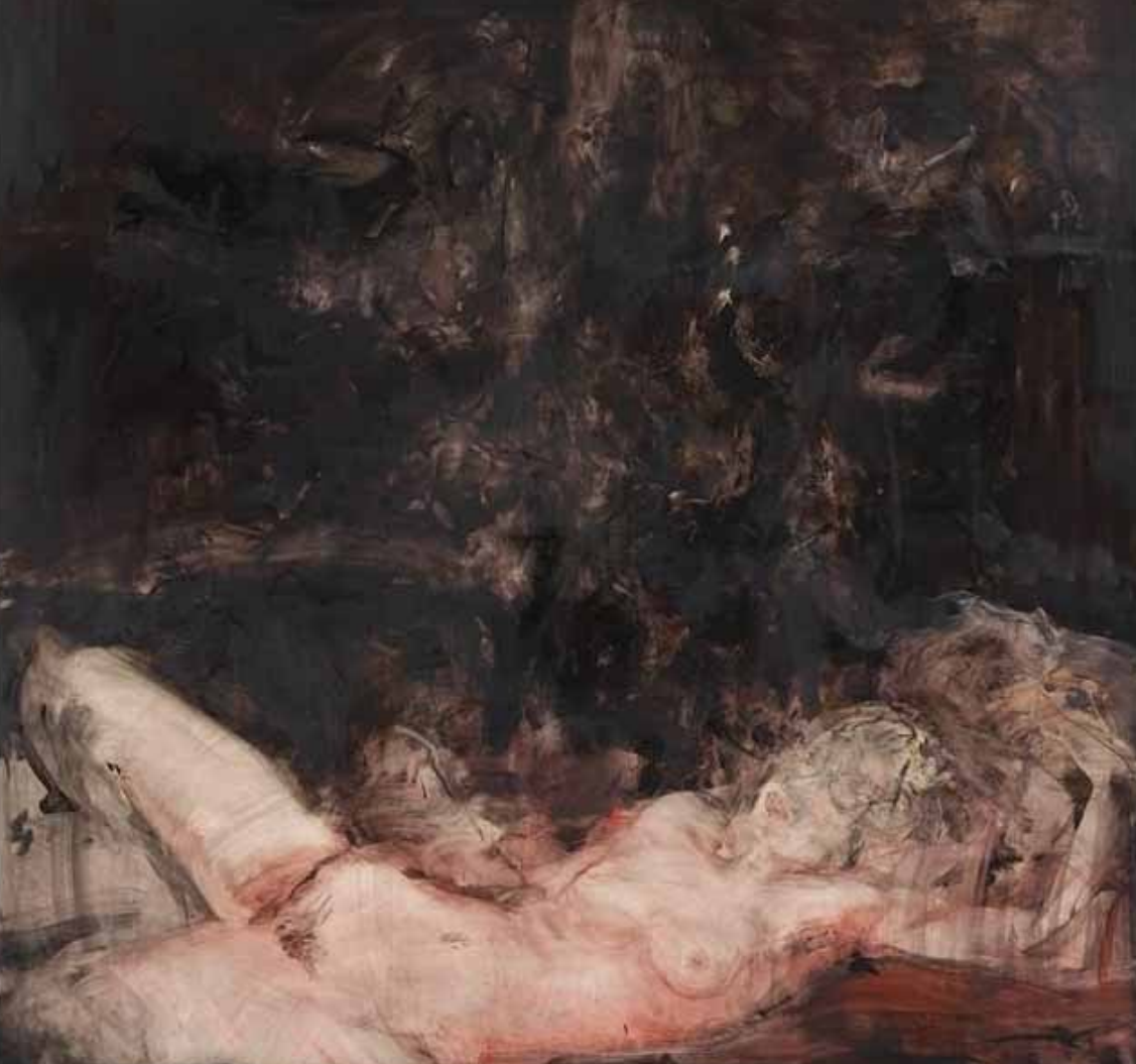
Cecily Brown Sentimental Fool , 2004 Oil on canvas