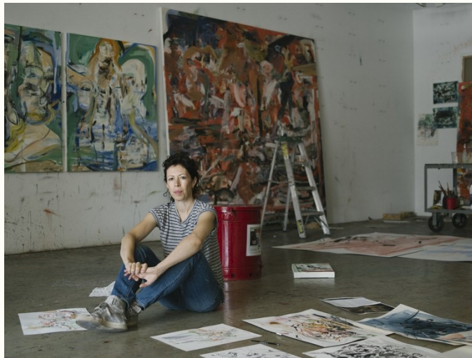
Brown, 2016

“I never think of painting as a cathartic thing, but I definitely think it’s a way of processing things...the way I see the world is fragmented. Recently I’ve been thinking of it more like shattered, everything is splintered,” Brown explained in a video profile for the 2018 Louisiana Museum exhibition, Where, When, How Often and with Whom . Brown discussed the triptych , made in 2017 and partially inspired by real world events, for which the show was titled.