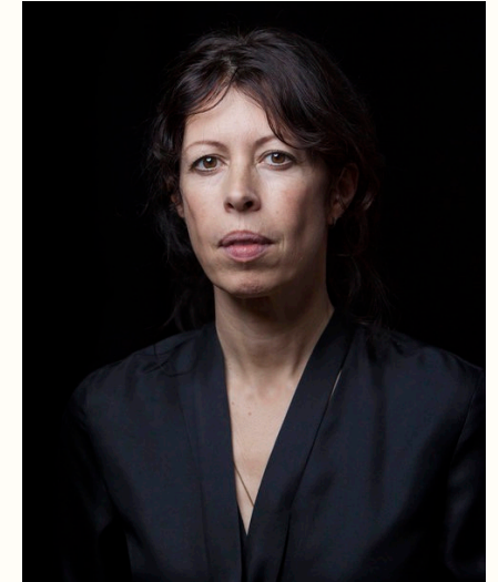
Brown, 2019

Apollo Magazine interviewed Brown as she prepared for her 2018 exhibition at the Louisiana Museum of Modern Art in Denmark. “Seeing a group of works together in a show is like the final part of the whole process of making paintings: seeing how they relate, what story they tell, and what they mean once they’re in the world,” Brown explained. “The excitement of doing a show like this is that I get to see what I’ve been doing for the past 20 years.”