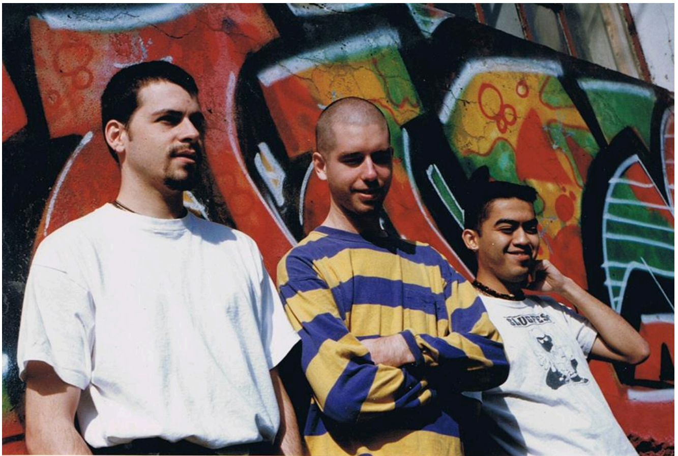
Blundermen, circa 1993

at the Blunderhouse), General Fools, Human Greed, and 84-78. Their Ontario partners-in-crime included: Hockey Teeth, Blowhard, Wad, Phallocracy, Mr. Nobody, No Man's Land, Chokehold, Crumble, Shotmaker and Watershed. They also played a couple of shows with Pittsburgh's Submachine, with whom they developed a good 'drinking' relationship. The venues they played were often small local bars, including Classic Studios (Queen St & Ossington Ave), Niagara Cafe (Queen St & Niagara St) and Project X (an all-ages music collective at Adelaide St & Portland St).