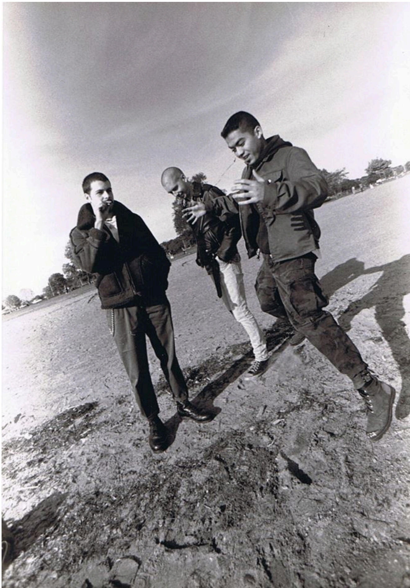
Blundermen, circa 1993