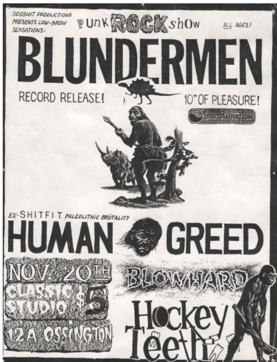
"Blunder on Bikini Island" release show on November 20th 1993.

1994 followed by the CD edition in 1995. Their album "Blunder on Bikini Island" ended up coming out in late November 1993, on 10" vinyl and cassette tape. The vinyl featured 7 songs, while the tape edition added their cover of 4 Skin's "Chaos". This mentioned cover would also be included on a later Fans of Bad Productions Records compilation, "GO!", which was released in 1997 on vinyl and 1998 on CD. The version of "Chaos" on "GO!" somehow got slowed down during the mastering process for the compilation (apparently Eva from Wad said their song had the same problem). But the version on the tape version of "Blunder on Bikini Island" remains at the correct speed.