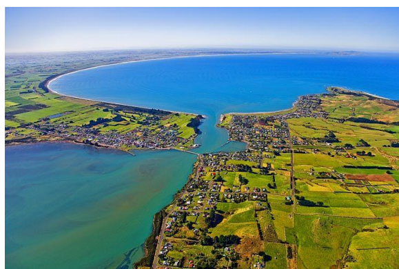
Aerial view of Riverton in the South Island