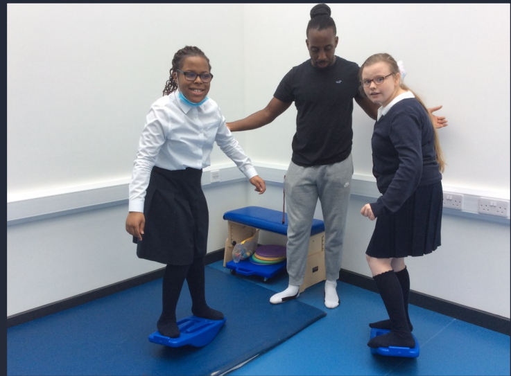
Balance and core strength exercises