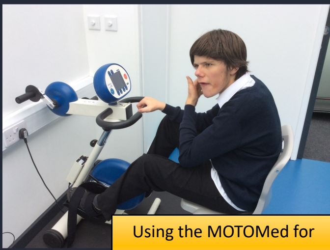
Using the MOTOMed for arm and leg strengthening