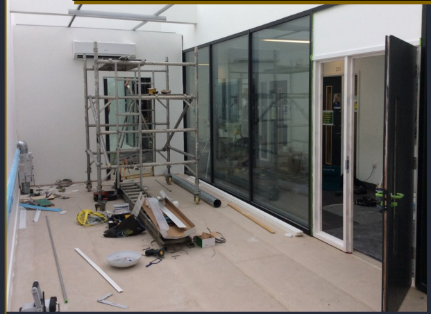
Room being constructed

Here are some photo updates on how our new training gym is being used for targeted physiotherapy and OT sessions by our sports Coach Raph.