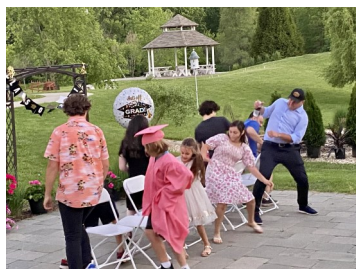
A competitive game of musical chairs after graduation.

All MSOL students in 1 st -9 th grades were invited to share their talents and performed at the amphitheater for their classmates, primary students and staff.