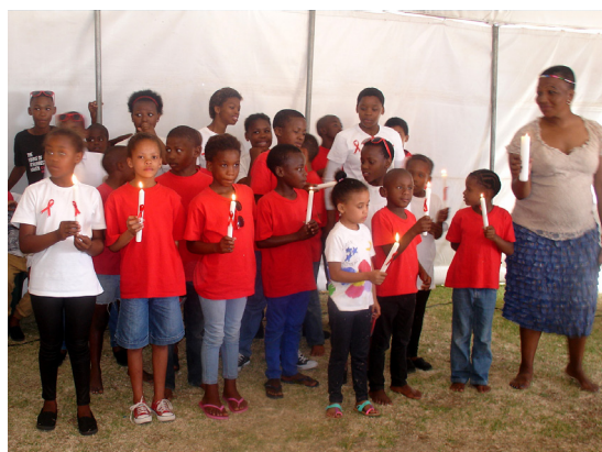
The children hold their lit candles in remembrance of those who have died of Aids related diseases.

A very varied programme was presented at the World Aids Day service held at the House of Resurrection Haven Children's Home on Thursday 1 December 2016. Items included a dance in celebration of their Khoi culture by some of the children; singing and dancing items by the teenagers and by the little ones; teaching talks from various groups of people and a testimony from one of the staff who has lived with Aids for 17 years.