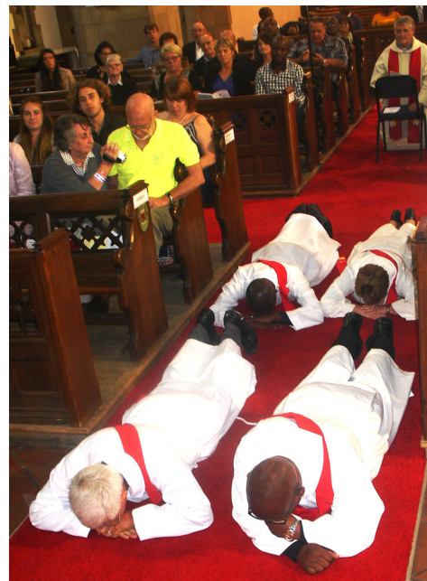
Ordinands prostrating themselves in humble obedience before the Lord and the Bishop.