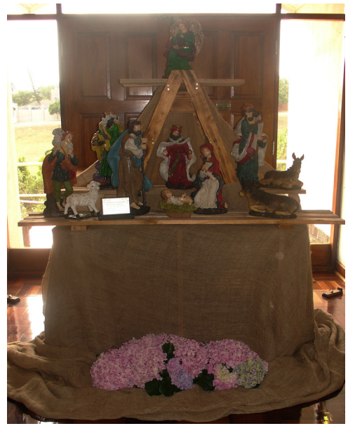
St Paul's in Parsons Hill had a beautiful Nativity display in their foyer to welcome everyone.