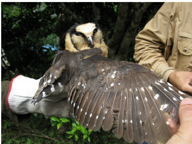
FIGURE 4. Aegolius harrisii , at Santa Rosa de Kuviriari, Cusco.