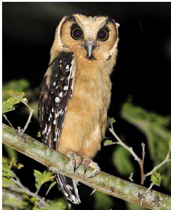
FIGURE 1. Aegolius harrisii at San Antonio Private Conservation Area, Amazonas department (Photo by Michell León).

We obtained information of six unpublished records from scientific collections, one unpublished recording of the species from Xeno-Canto ( http://www.xeno-canto.org ).