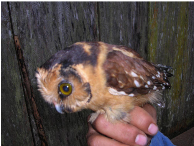
FIGURE 3. Aegolius harrisii, at Abra Patricia, Amazonas department.