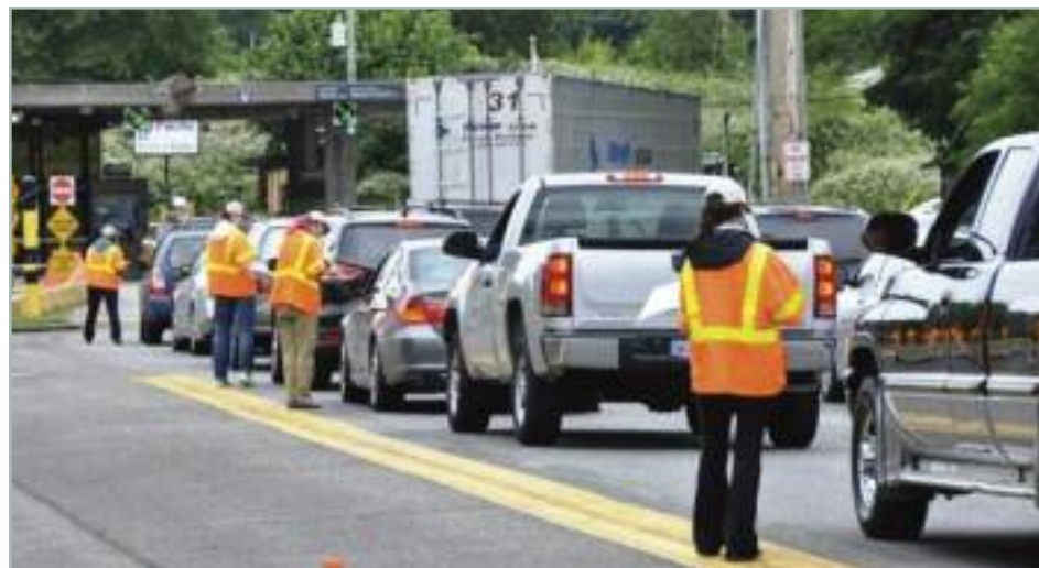
■ Members of the Border Policy Research Institute survey crew interview cross-border travelers.