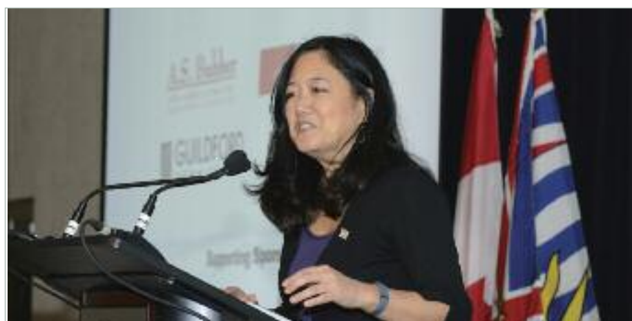
■ Naomi Yamamoto, Minister of State for Tourism & Small Business at Women in Business Awards.