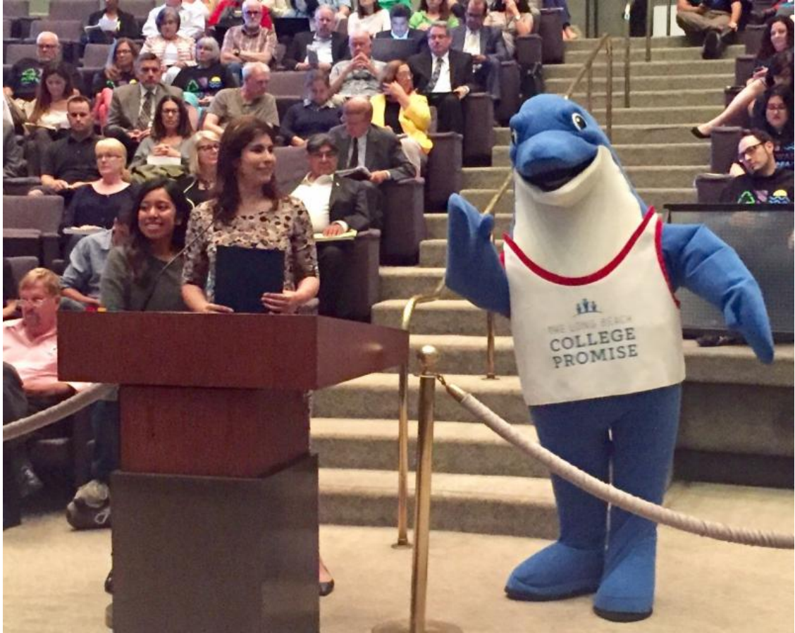
"Flippa" the College Promise dolphin greets the council members