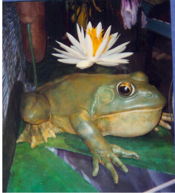
Bullfrog and Water lily by Blake Ketchum. fiberglass, plastics, paints and resins.

Unlike many art lessons, these aim to get you thinking creatively and using art as a form of communication and expression rather than simply following the steps to make new version of the instructor's work! You will learn the artistic process, not how to follow a recipe.