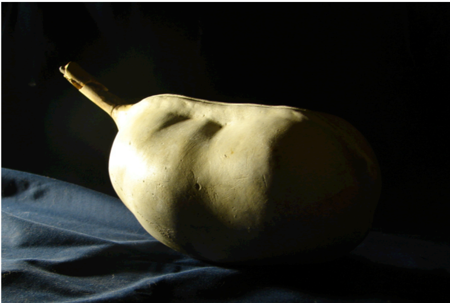
Pod Form by Blake Ketchum

Lesson 6: Proportion and Gesture. Learn human proportions and modify them to suit the concept of your sculpture. This lesson also covers some techniques of armature construction.