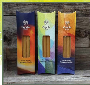
Camphill Village Copake Etsy Store etsy.com/shop/CamphillVillageStore