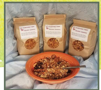
Plowshare Farm Store www.etsy.com/shop/LocalShare