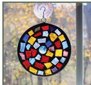
Camphill Village Kimberton Store camphillkimberton.org/cvkh-craft-shop