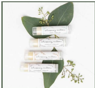
Entwine Studio - Camphill Soltane studioentwine.square.site