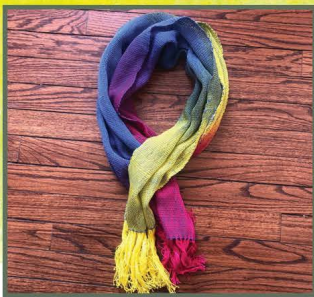
The Artisan Shop - Camphill Hudson camphillhudson.store