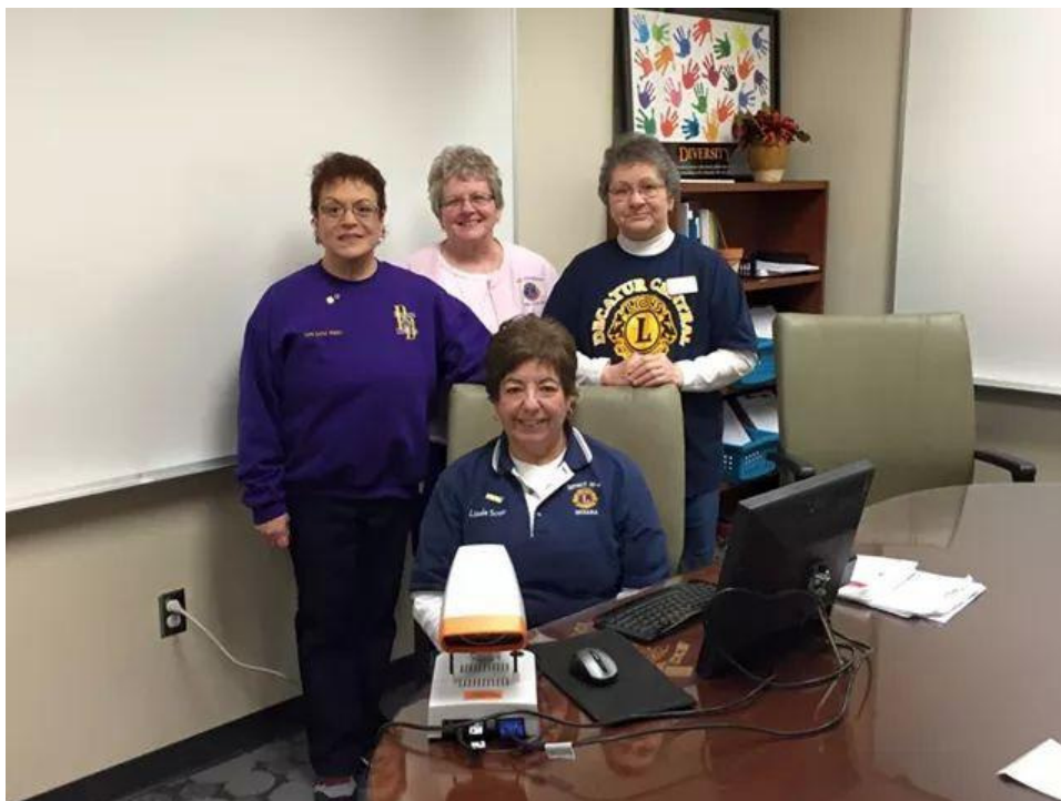
The kidsights newest team has been busy in these cold days. We have been Screening preschools on the south and southwest part of 25f.