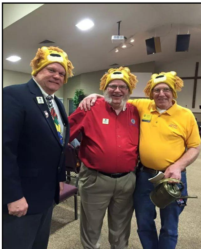
Tail Twisters at the Recent Cabinet meeting.