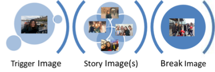
Fig. 3. Illustration of an event board

F is a set of features characterizing the group of users, locations and times in the event. It is represented as: