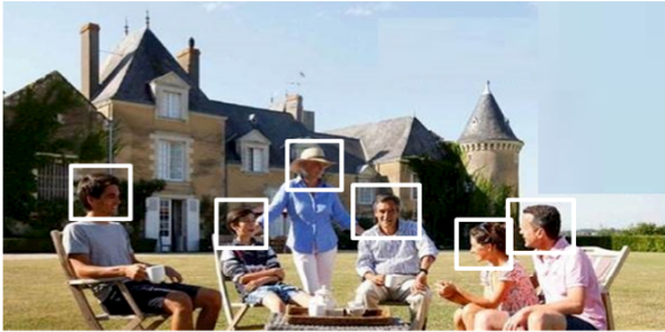
Fig. 2. Example of a story image representation with its metadata

img is called story image or s_{img} if its metadata contain at least one face in O or indicate a place in g (i.e., g is not empty) within the captured scene. img is called trigger image or t_{img} if its metadata contain one or more particular faces or indicate a significant place that cause an event to happen. img is called break image or b_{img} if its metadata shows the end of the event (e.g., a back-home photo). For example, Fig. 2 shows a story image with its metadata. O encloses all the faces identified in the image (represented here by square brackets).