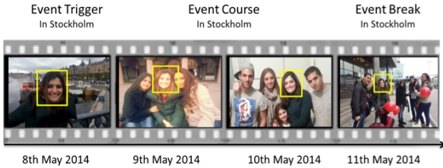
Fig. 1. Some photos of u_0 taken in Stockholm over the four days of the trip showing her colleagues (2 nd and 4 th photo) and her old friends (3 rd photo)

u_0 has photos in Stockholm over the four days (Fig. 1).