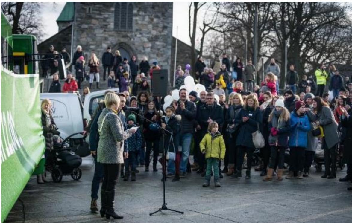
Figure 4. Presentation of the Triangulum battery buses to the public 11 th February 2017.

The purpose was to create a greater awareness of the project and to demonstrate the e-buses. The competition started 12 th February with a kickoff event, and the winner was announced in June 2016. In February 2017, the busses were unveiled by the County Mayor. See the video from the event (Greater Stavanger Facebook page): https://www.facebook.com/greaterstavanger/videos/1454092654609533/