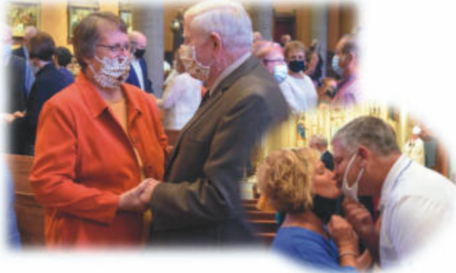
Photos from the 2020 Anniversary Mass courtesy of The Catholic Post.

Anniversary Mass: If you are celebrating 25 or 50 years of marriage in 2021, notify the parish office. You may telephone (815) 883-8233 or e-mail ( office@hfoglesby.org ). Each couple will receive a personal invitation this summer from the Bishop to attend a celebratory Mass at the Cathedral of St. Mary on September 26th at 3:30 p.m.