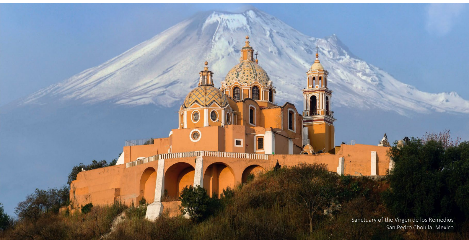
Sanctuary of the Virgen de los Remedios San Pedro Cholula, Mexico

Elaborated by Interamerican : interamericanetwork.com