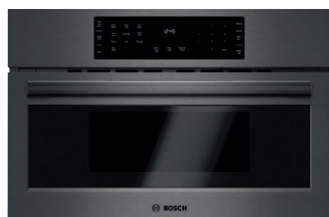
HMC80242UC Black Stainless Steel