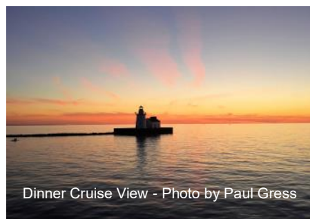
Dinner Cruise View